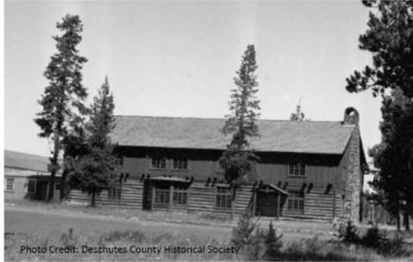
Camp Abbot Site, Officers' Club