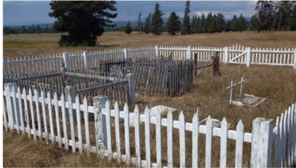
Allen Ranch Cemetery