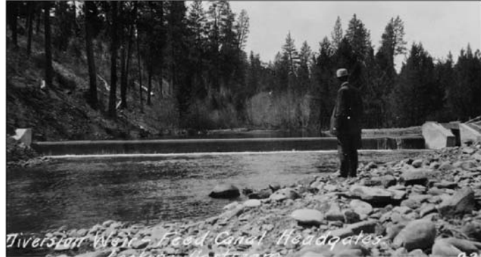
Tumalo Creek – Diversion Dam

29. Tumalo Creek – Diversion Dam The original headgate and diversion dam for the feed canal was constructed in 1914. The feed canal's purpose was to convey water from Tumalo Creek to the reservoir. The original headworks were replaced and the original 94.2 ft low overflow weir dam was partially removed in 2009/2010 to accommodate a new fish screen and fish ladder. The remaining original structure is a 90 foot (crest length) section of dam of reinforced concrete. Tax Map 17-11-23, Tax Lot 800 & 1600.