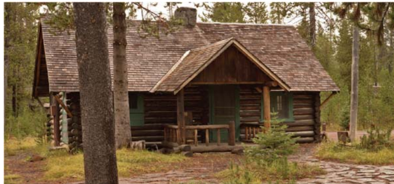
Elk Lake Guard Station

37. Elk Lake Guard Station: A wagon road built in 1920 between Elk Lake and Bend sparked a wave of tourism around the scenic waterfront. To protect natural resources of the Deschutes National Forest and provide visitor information to