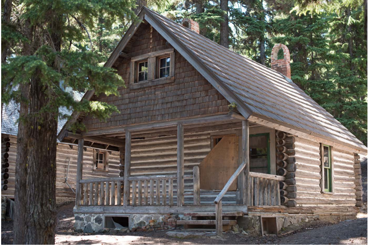
Photo: Independent Order of Odd Fellows (IOOF) Cabin, Paulina Lake